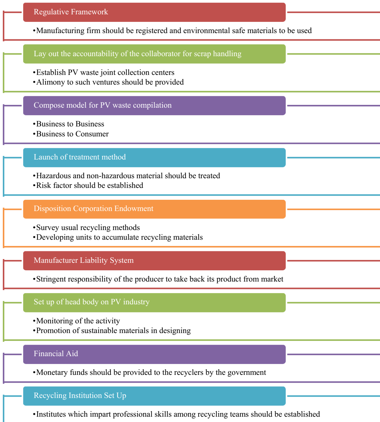
Figure 2. Proposed Solar PV Reclaiming Policy Framework for Indian Government